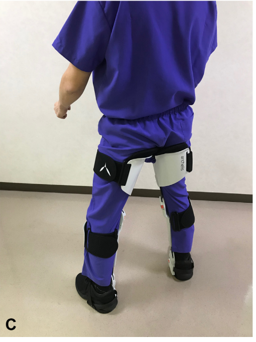
Figure 1. A, The Archelis wearable chair. B, Endoscopist wearing the Archelis (front view). C, Endoscopist wearing the Archelis (back view).