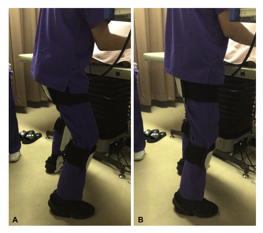
Figure 2. Sit-stand endoscopic workstations with Archelis. A, Sitting position during upper-GI endoscopy. B, Standing position during upper-GI endoscopy.

Endoscopists spend significant amounts of time standing during endoscopic examinations and procedures. Recently, endoscopy-related musculoskeletal injuries such as thumb, lower-back, hand, and neck pains have been recognized increasingly among endoscopists. <sup>1,2</sup>